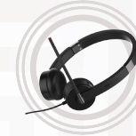
Lenovo Stereo 3.5 mm Headset