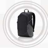
ThinkPad Active Backpack