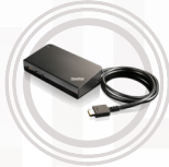
ThinkPad USB 3.0 Pro Dock