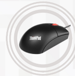
ThinkPad USB Travel Mouse